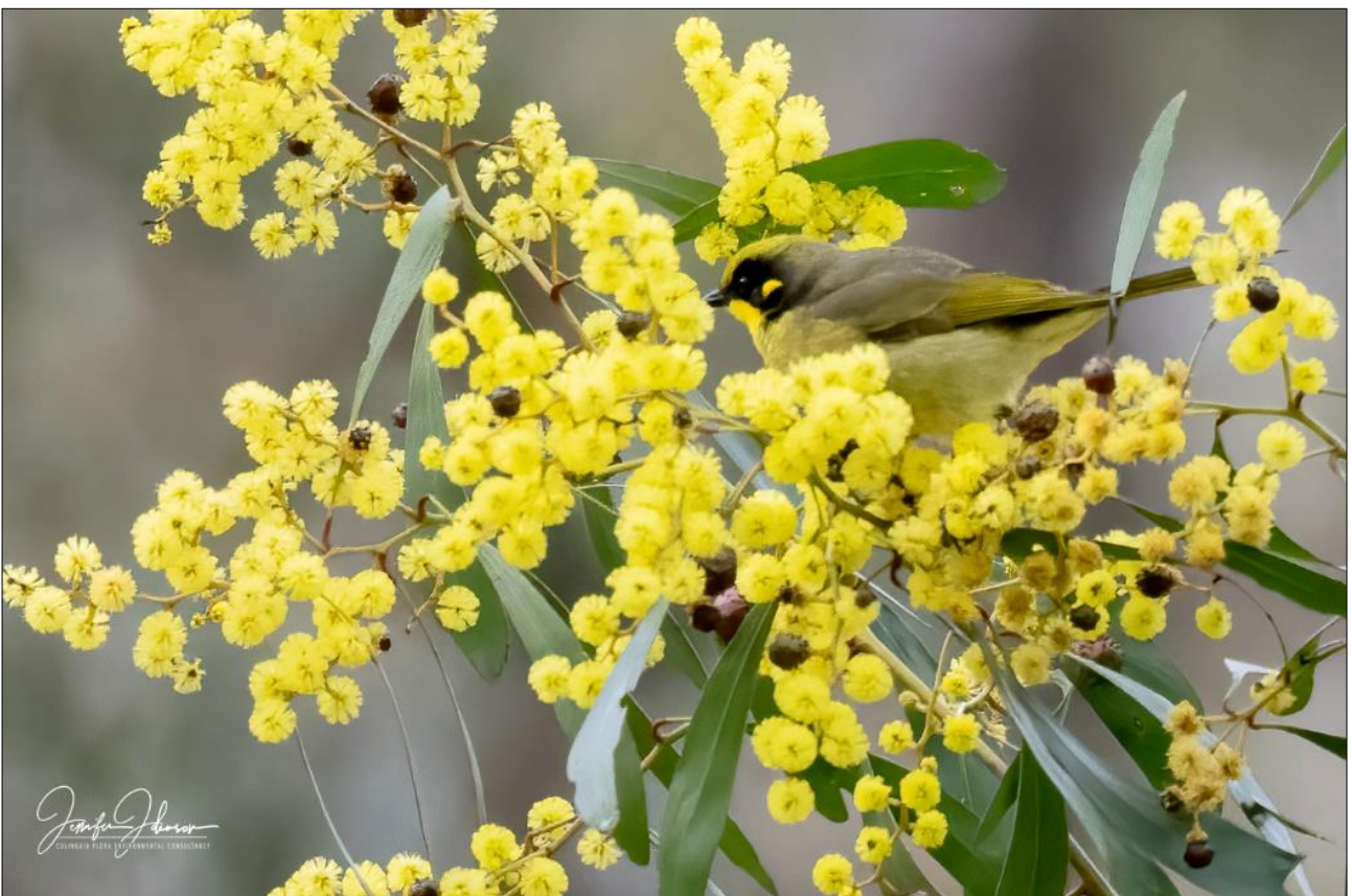
Yellow tufted Honeyeater on Golden Wattle ( Acacia pycnantha )