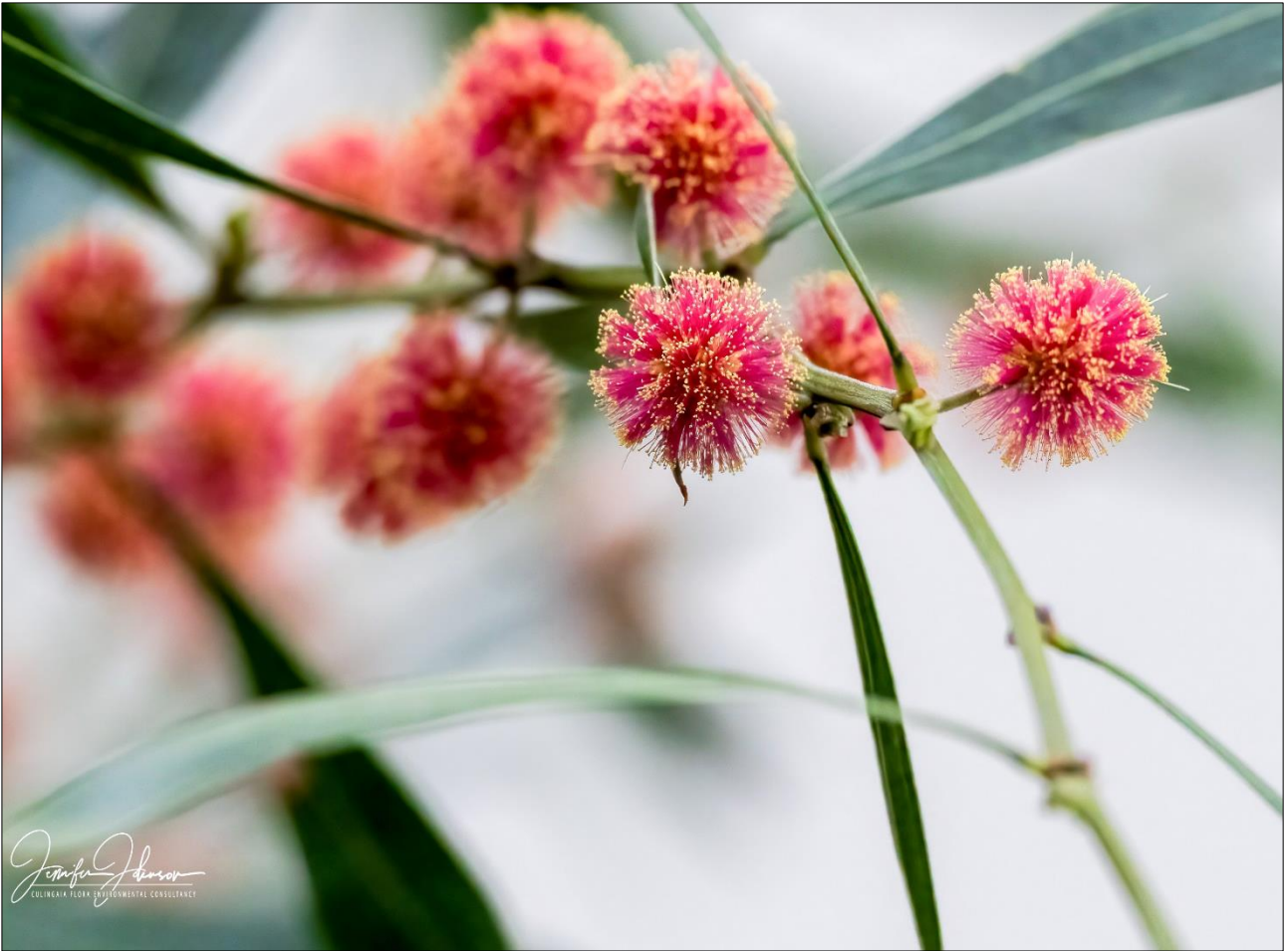
Acacia leprosa 'Scarlet Blaze'